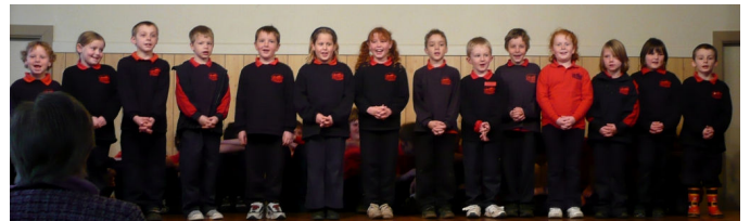
Prep to Grade 2 students

Everyone then had an opportunity to look over the school, and the students were very keen to show their grandparents and friends what they have been achieving. Now it's time for a well earned break for them and the teachers!