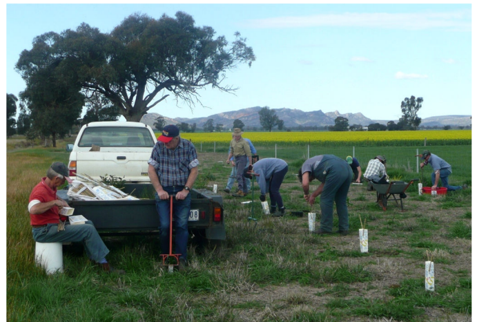
Laharum Landcare Group recent planting

The annual 'Over 60s/Special Persons Luncheon' at Laharum Hall was held on Wednesday August 6. The Laharum Primary School students served a delicious hot meal to a crowd of over 60 people and then performed a concert while the crowd sat back and thoroughly enjoyed their wonderful educational show. It was really entertaining!