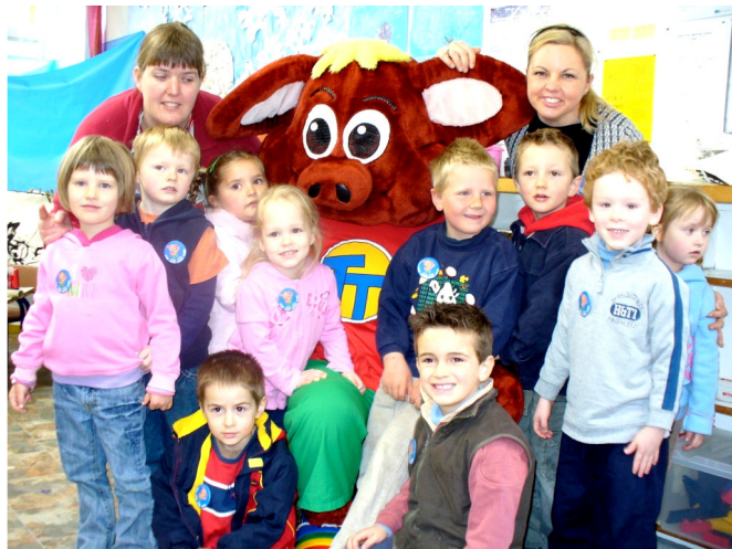
Preschool children with Thingle Toodle

Our next visitor was Thingle Toodle who is presented by the RTA's road safety program. Thingle came into kinder (a large man sized puppet) and danced and sang with the children while they showed him how to cross the road and what to do in the car and on bikes. All the children were then initiated into the Thingle Toodle club but this means they have to sit in the back seat at all times. This was interesting when some of the kids started to tell Thingle what they did on the farm utes - I think he froze in horror!