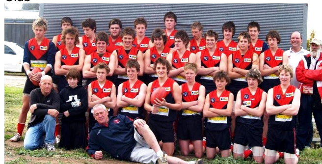
Laharum Under 17s Preliminary Final