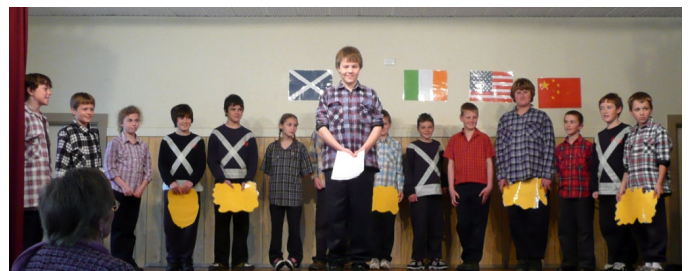
Grades 3-6 students