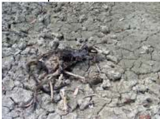
My dam January 2009

Photos and articles for this newsletter are much appreciated