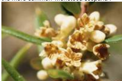
'Monotoca billawinica' – male flower

Sunday March 8 (Labour Day weekend) - all day activity. This survey will involve checking the number of surviving little-known rare plant 'Monotoca billawinica' - Grampians Monotoca. We will also be checking along the way for the more common 'Monotoca scoparia'.