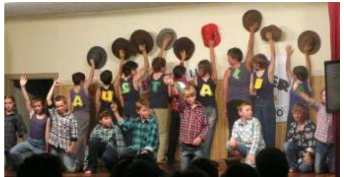
Laharum Primary School concert December 2008