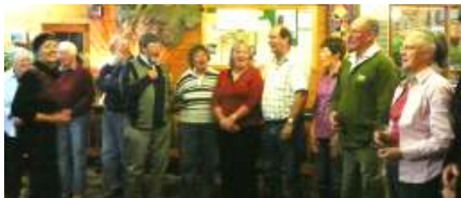
'Wartook warblers' at the first Vocal Nosh!