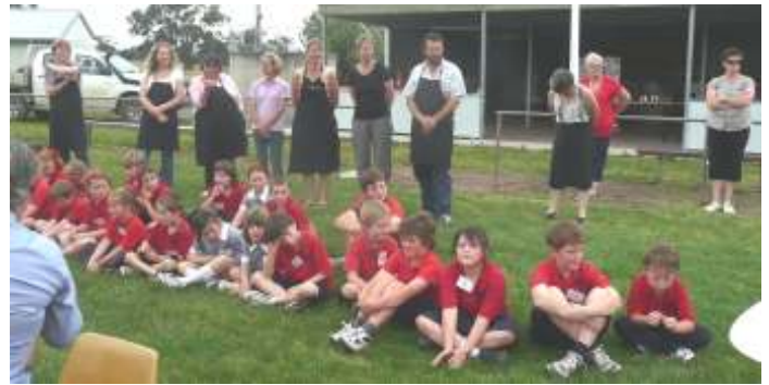
Workers taking a 'breather' after the successful Long Lunch

This newsletter is printed on 100% recycled paper - helping towards reducing Australian landfill