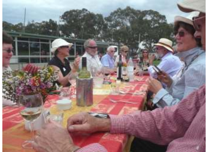
Some of the crowd enjoying the Long Lunch on November 12