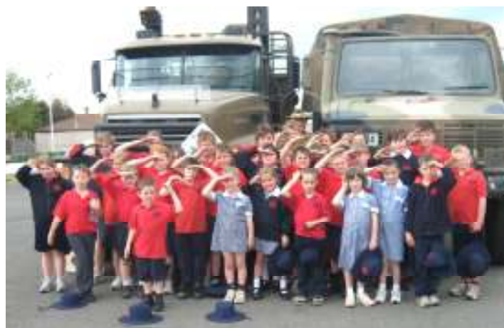
Laharum Primary School children visit the Horsham ADF