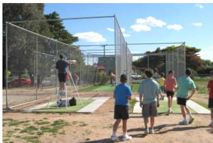
Junior cricket training at Sunnyside Monday afternoons