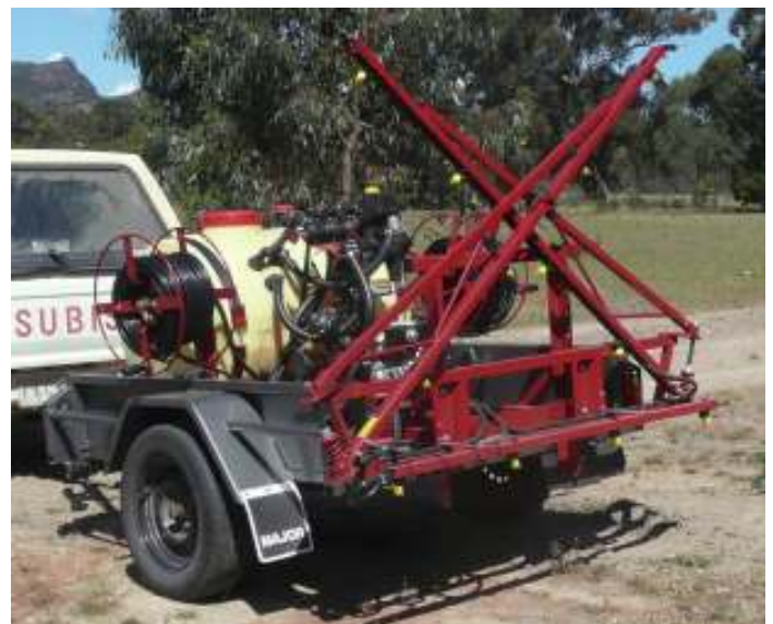
Laharum Landcare new spray trailer with boom and 2 50m hose reels, which has already done more than 150 person-hours work!