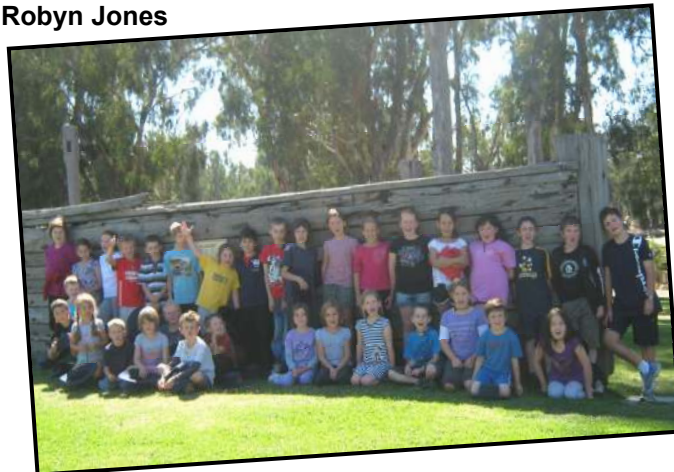
Laharum PS on camp in Echuca from April 4-8