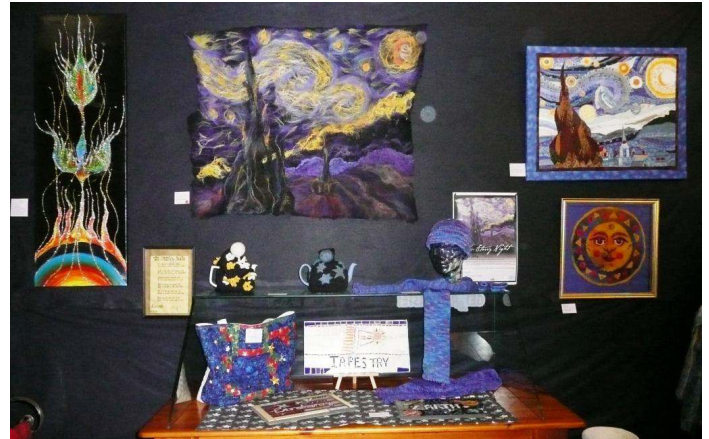
Starry starry night exhibition at Wartook Artist Studio - part of Art Is.. Under Our Sky' Festival in April

Anything left over will be donated to Laharum Primary School, Laharum Kinder or the Salvos