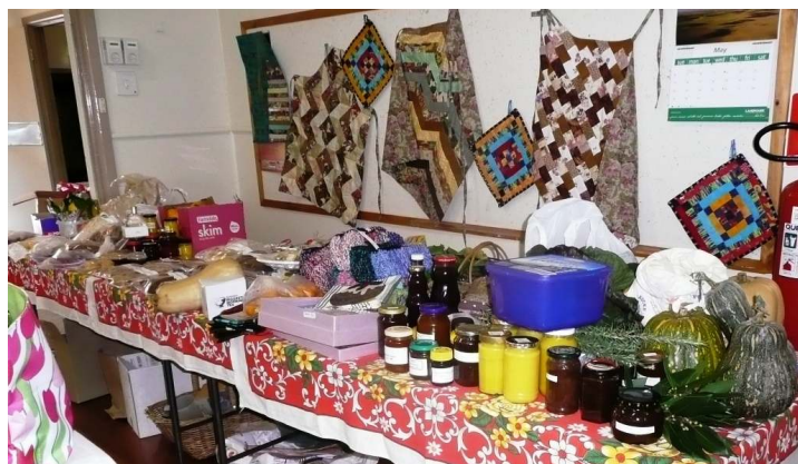
'Bring and buy' stall at the Biggest Morning Tea, Laharum Hall – May 26

Hindmarsh Shire; Horsham Rural City Council; Northern Grampians Shire; West Wimmera Shire; Yarriambiack Shire (south of the netting fence).