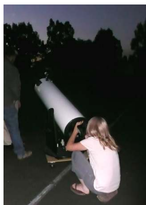
Setting up the telescope at the astronomy night at Laharum Hall in April