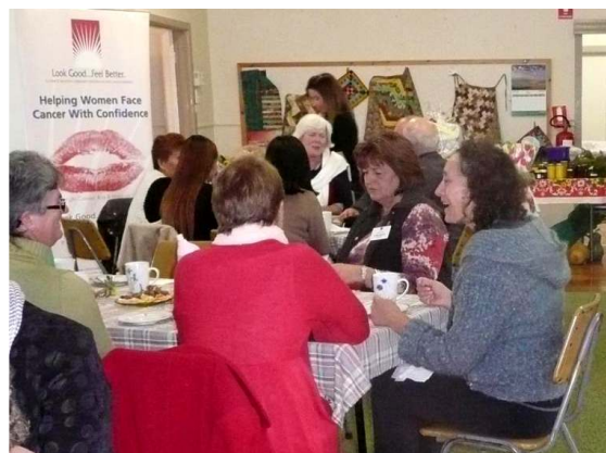
Catching up with friends at the Biggest Morning Tea