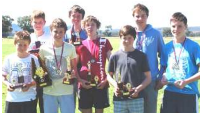
Under 14 trophy winners