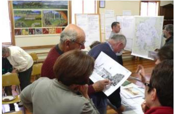
Checking our cultural heritage details at Laharum Hall on September 21