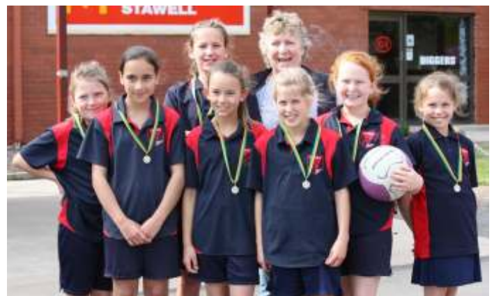
Laharum netball Modies on grand final day