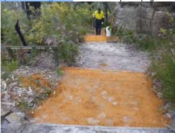
Replacing eroded steps on the Sundial walking track

For updated walking track information you can download our flood recovery update sheets from www.parkweb.vic.gov.au on the Grampians page.