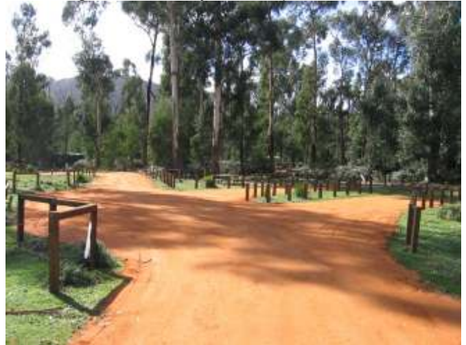
Car park resurfacing at Jimmy Creek Campground

Jimmy Creek campground – works have been completed to re-sheet the car park and repair the campsite pads. New barbecues have been installed and repairs to the toilets were carried out. The pedestrian bridge behind the campground remains closed as does the walking track to Teddy Bear Gap.