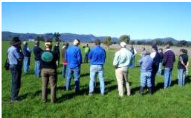
Pasture walk during the WCFA Conference on August 24